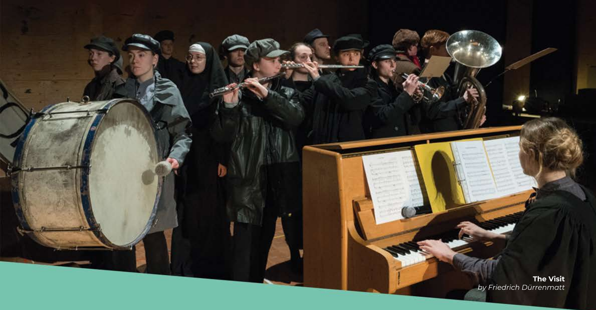
The Visit by Friedrich Dürrenmatt