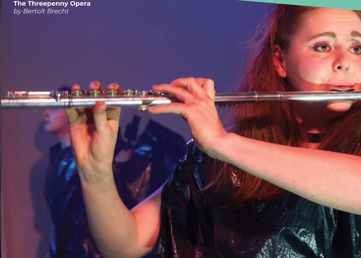
The Threepenny Opera by Bertolt Brecht