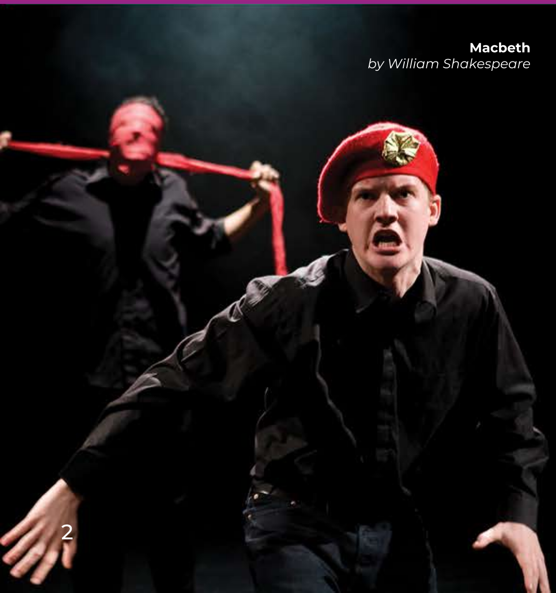
Macbeth by William Shakespeare