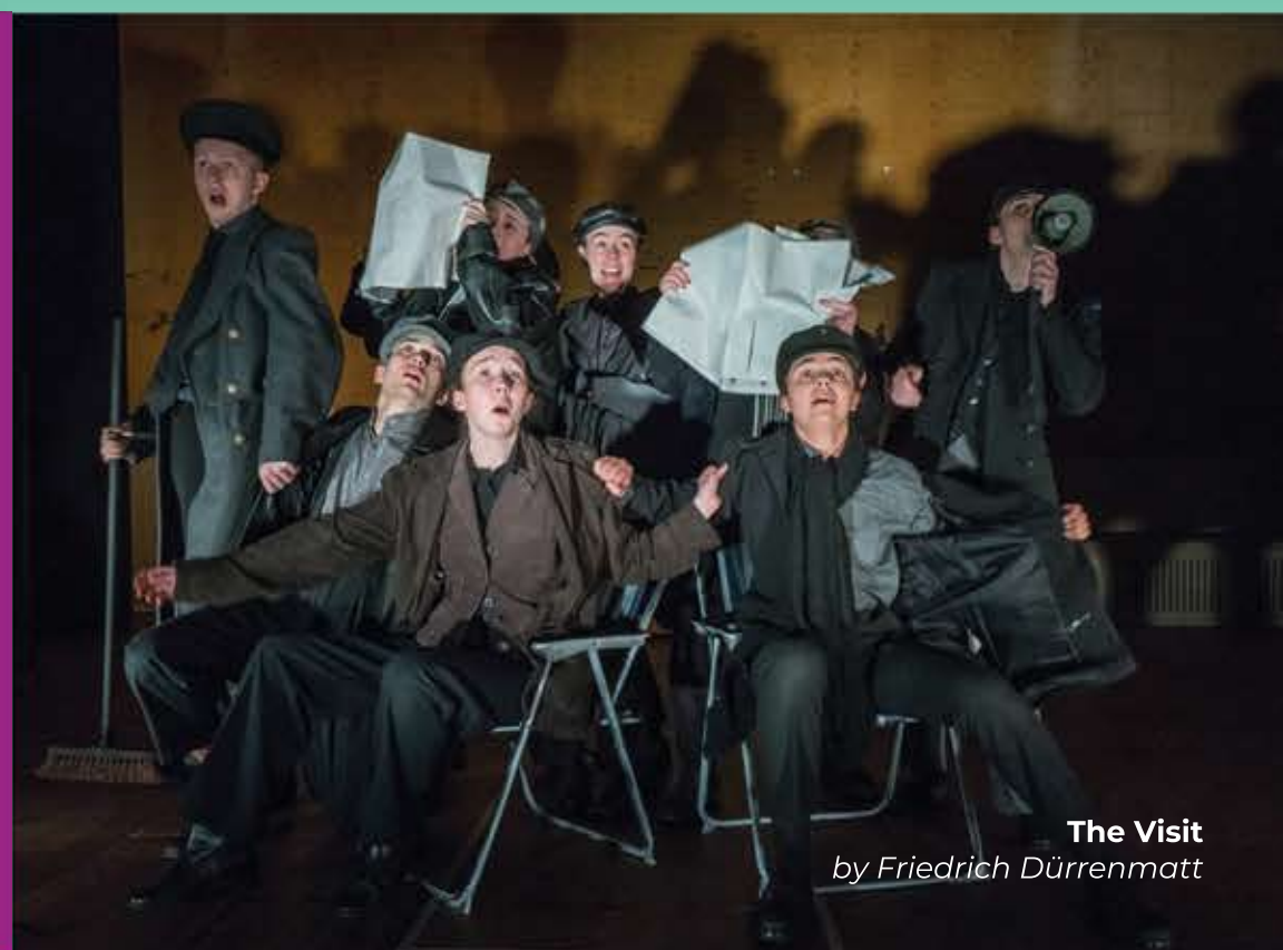
The Visit by Friedrich Dürrenmatt

These skills will be developed in class, practical workshops, seminars, extended projects and in performance.