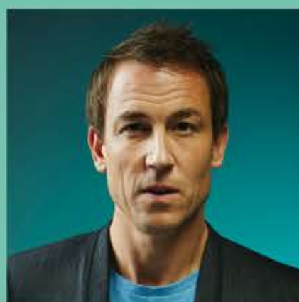
Tobias Menzies Actor

The Crown (Netflix) This Way Up (Netflix) Game of Thrones (HBO)