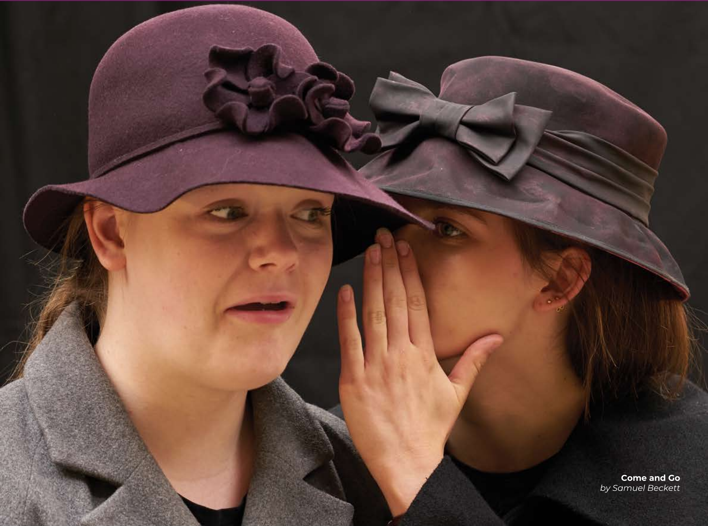
Come and Go by Samuel Beckett

Acting classes and workshops in acting technique form an important part of what we do. Many of the company's visiting professionals employ working practices related to a range of recognised and influential theatre practitioners. They often have years of experience applying these various methods in their careers as actors or directors. They bring and share their expertise, offering students a chance to explore a wide range of these techniques both in rehearsal and practical workshops.