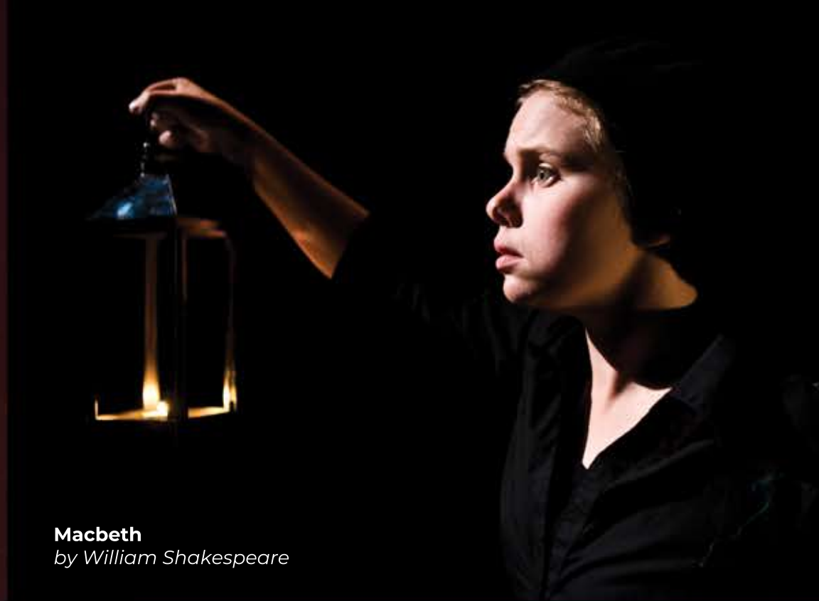
Macbeth by William Shakespeare